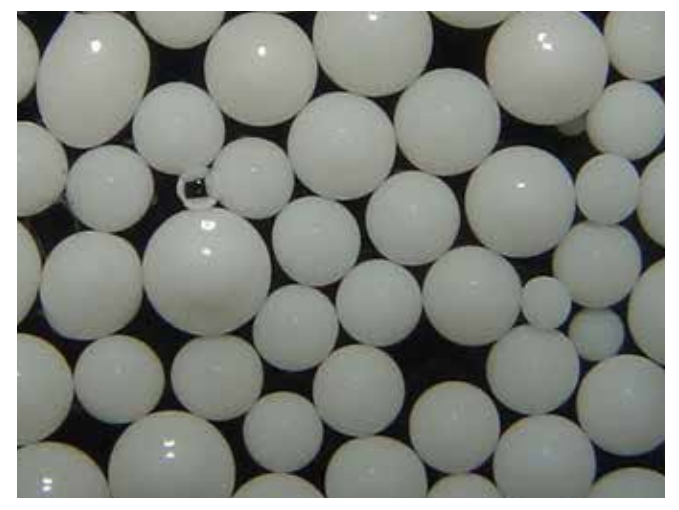
Figure 1: Macroporous resin.

Figures 1 and 2 show examples of IX resins that could be stored.